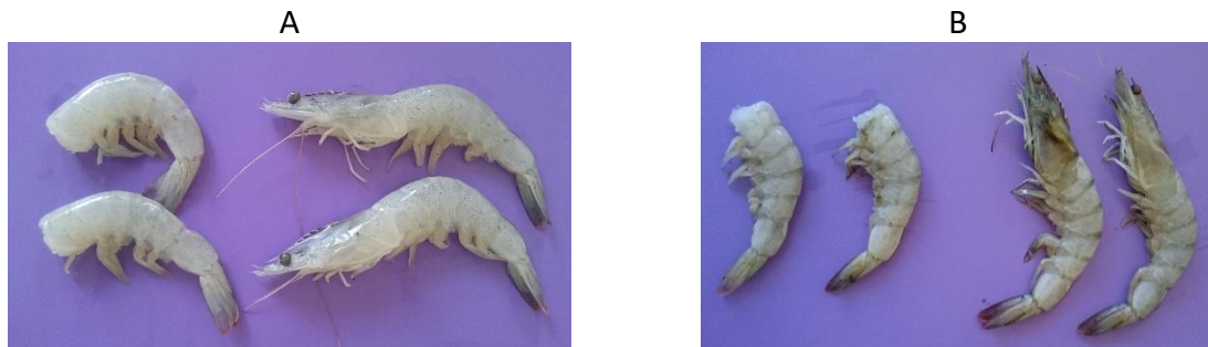
Fig. 3. Fresh (raw) shrimps from batch from RAS in Lithuania after 1 (A) and 7 (B) days of storage in temperature of 1÷3°C.