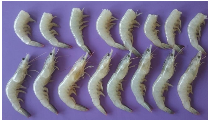
Fig.1. The analyzed batch of shrimps from Lithuania.

The results of the morphometric analyzes of shrimps from Lithuania are presented in the Table 1, whereas of sensory tests on the figures 2 and 4.