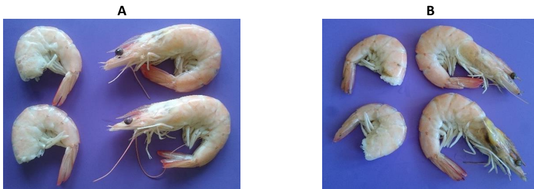
Fig. 5. Fresh (cooked) shrimps from batch from RAS in Lithuania after 1 (A) and 7 (B) days of storage in temperature of 1÷3°C.