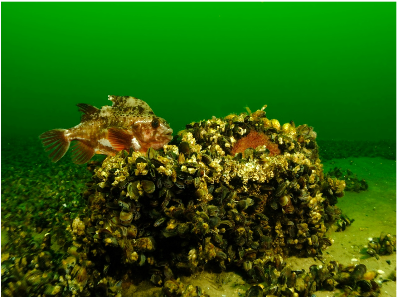
Figure 1. Lumpfish (Cyclopterus lumpus) guarding its nest, built on concrete block, covered with mussels

2015). In the late production cycle the farm became a net source of nutrients, mainly due to excretion by mussels but also due to the release of nutrients from the sediments. It was therefore recommended to harvest the mussels within the first year of the production cycle. It is not known if the same conclusion also is valid for mussel farms within the Baltic Sea, where the blue mussels are smaller compared to mussels in more saline waters.